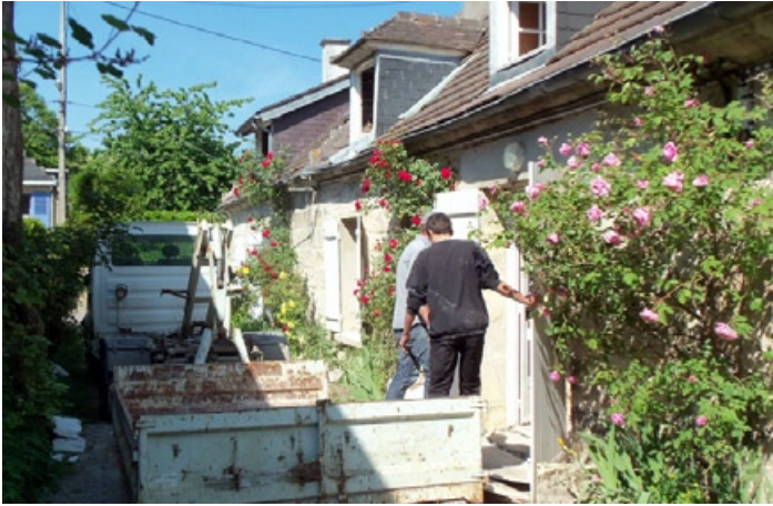
Renovation works at Rameau