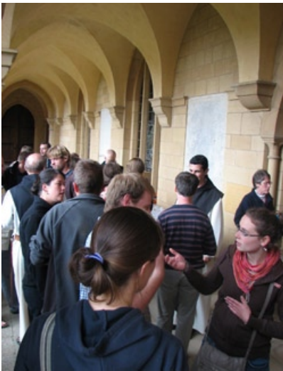
Young people on retreat in Orval

My peaceful rest-break at the monastery of Orval began with a bump!