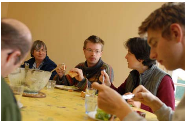
a meal in Le Val Fleuri, Trosly