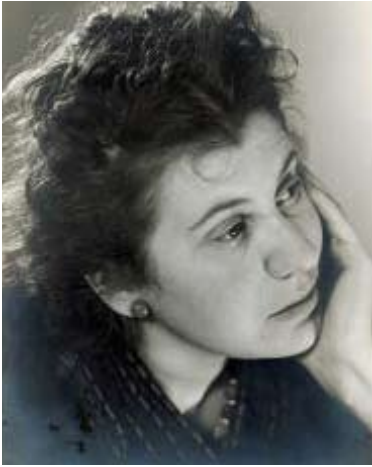
Etty Hillesum

Etty Hillesum often comes to mind. In 1942 when she was living in that terrible camp for Jews who were destined to die in Auschwitz and when Europe was dominated by Hitler's demonic clan, she used to pray: "Yes my Lord, you seem so incapable of changing a situation which in the end is so bound up with this life. I do not ask for an explanation, on the contrary it is up to you to call us to account one day. It seems to me more and more clearly at every beat of my heart that you cannot help us but that it is up to us to help you and to defend to the end the home that shelters you in us." What is important, she is saying, is to live in the arms of God.