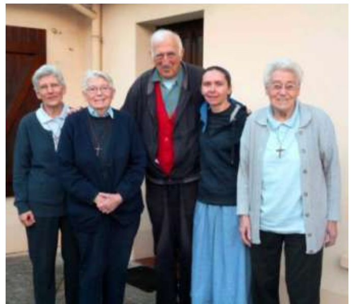
Little Sisters of Jesus at Berck