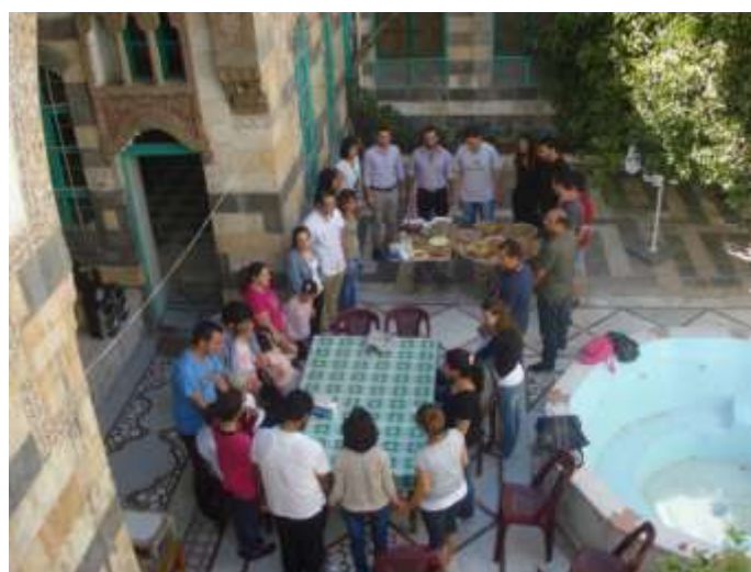
Al-Safina L'Arche at Damas