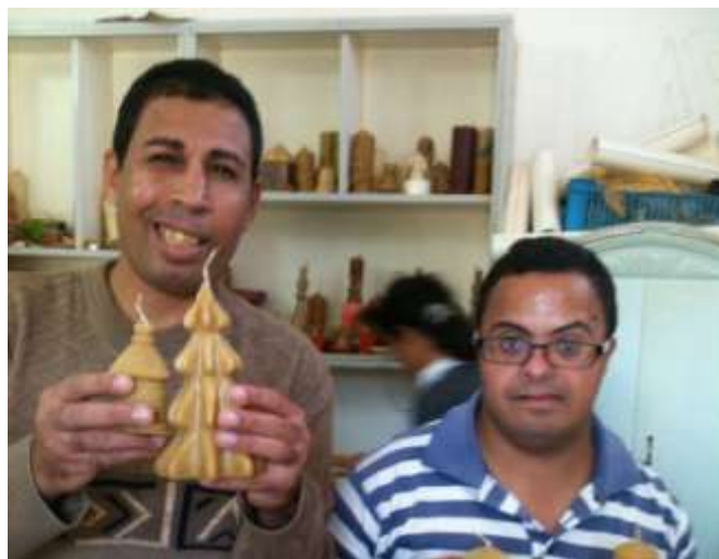
Al-Fulk L'Arche in Egypte