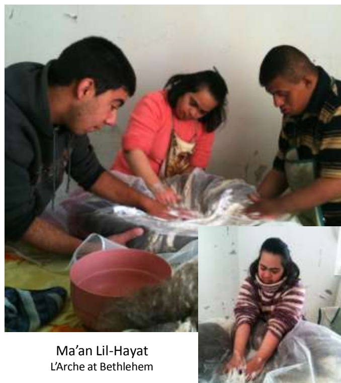
Ma'an Lil-Hayat L'Arche at Bethlehem