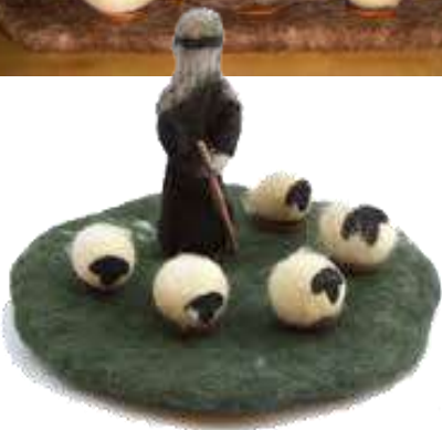
Crib made by L'Arche workshop at Bethlehem: Ma'an Lil-Hayat